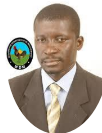
Manuel de Araújo, Mayor of Quelimane, Moçambique