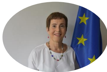
Diana Aconcia, Ambassador of the Delegation of the European Union to Ghana, representing DG Climate Action