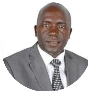
Kyanja Vincent de Paul, Mayor of Entebbe, Uganda