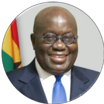
H.E. Nana Akufo-Addo President Republic of Ghana