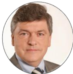
Tomas Chruszczow High Level Climate Champion