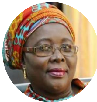
Hon. Hajia Alima Mahama, Minister of Local Government and Rural Development, Ghana