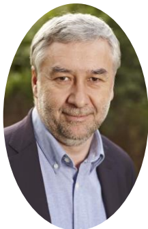
Ronan Dantec, French Senator, Spokesperson on climate for UCLG and President of Climate Chance