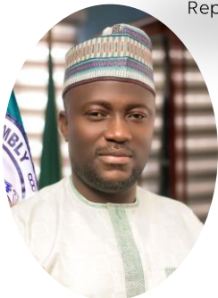
Adjei Sowah, Mayor of Accra