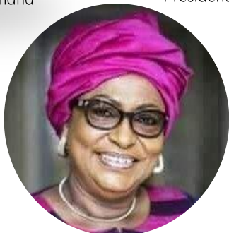
Soham El Wardini, Mayor of Dakar