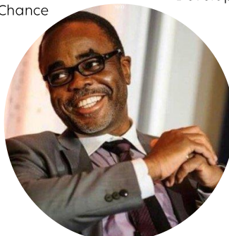
Luc Gnacadja, former Executive Secretary of the UNCCD & former Minister of Environment