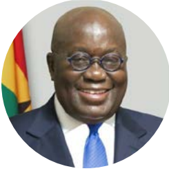
H.E. Nana Addo Dankwa Akufo-Addo, President of the Republic of Ghana

" The General Assembly of the United Nations is usually held at the time of year when the extremes of nature are on display around the world. Maybe we are being urged to take notice, and hopefully take practical and proactive steps to curb human activities that are endangering our planet. Our world is enriched by the diversity of cultures and religions and beliefs – they add spice to our lives. But there are scientific and mathematical truths that do not change with space or time, and these truths we all do well to uphold. Now that the scientists have spoken on the realities of climate change, I believe it is time to direct our energies to what we can and should do to counteract the danger, and stop unnecessary arguments. Nature has been brutal this year in demonstrating to us that our climate is changing, and we are probably pushing our world to destruction. The devastation wreaked by Cyclone Idai, Hurricane Dorian, the extreme summer temperatures across Europe, surely provide evidence, if some were still needed, that it is time to take action to bring back our world from the precipice. "