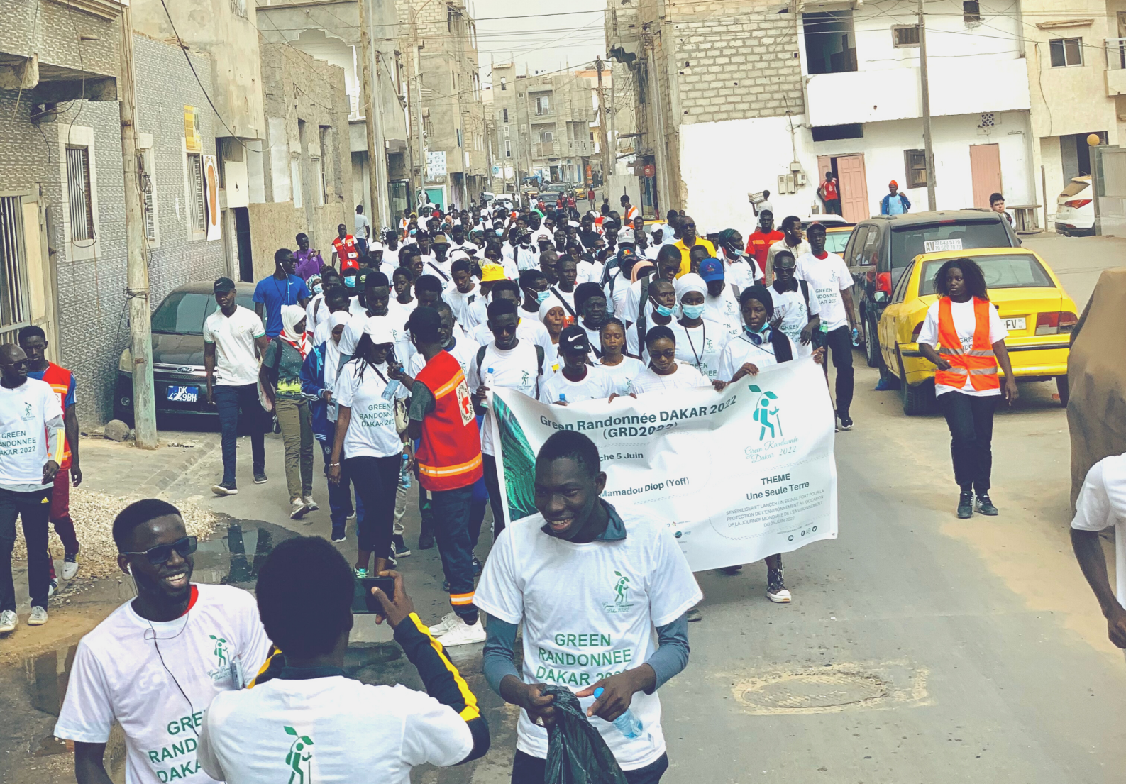
Green Randonnée Dakar 2022