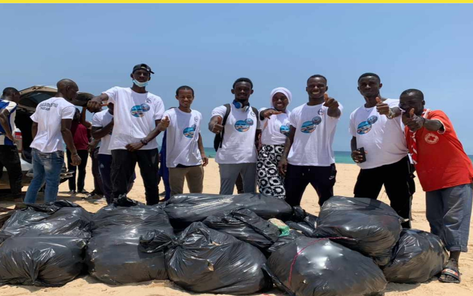
CRAC - Framework for Citizen Reflection and Action