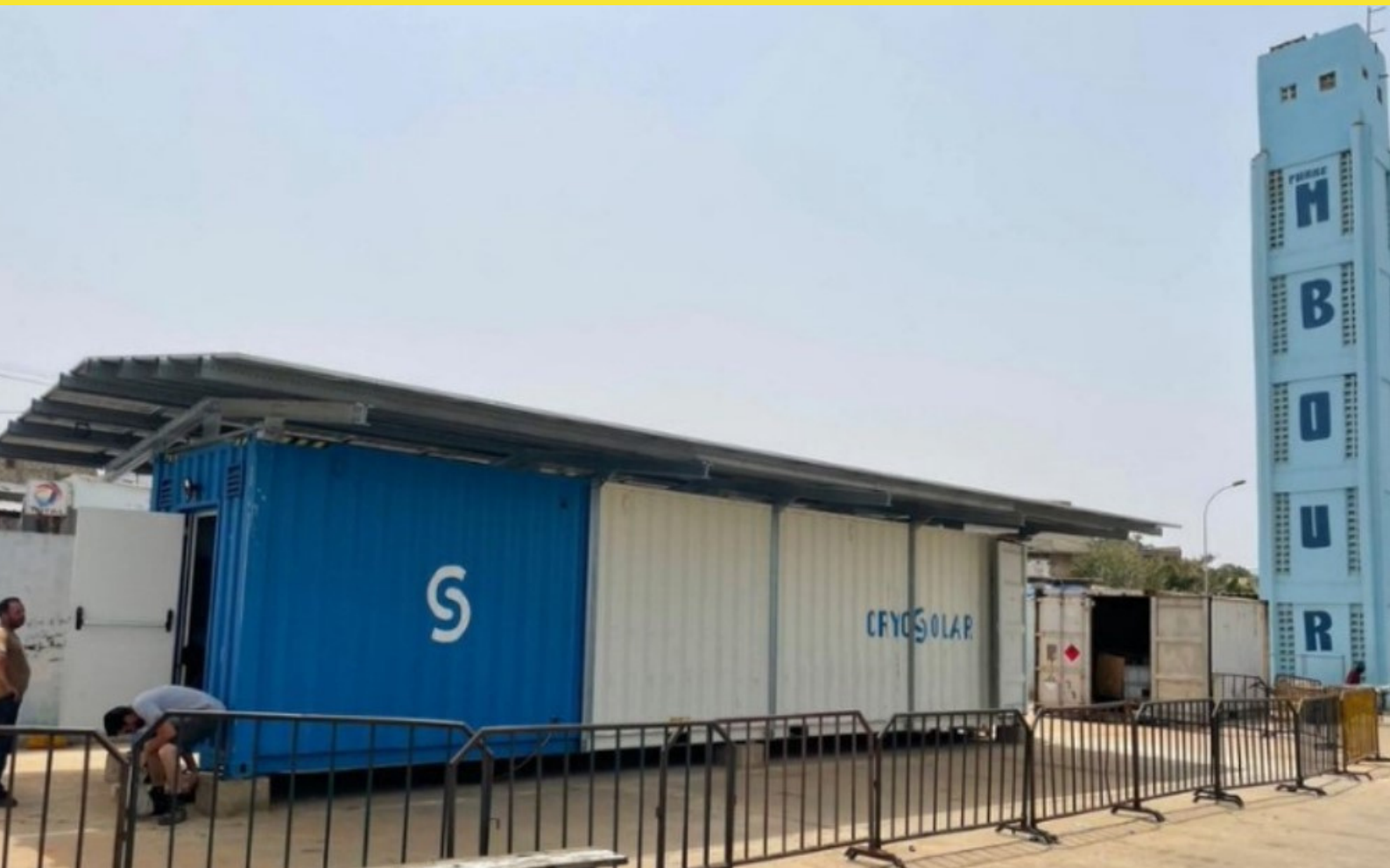
CryoSolar Mbour - Senegal, 07.2021