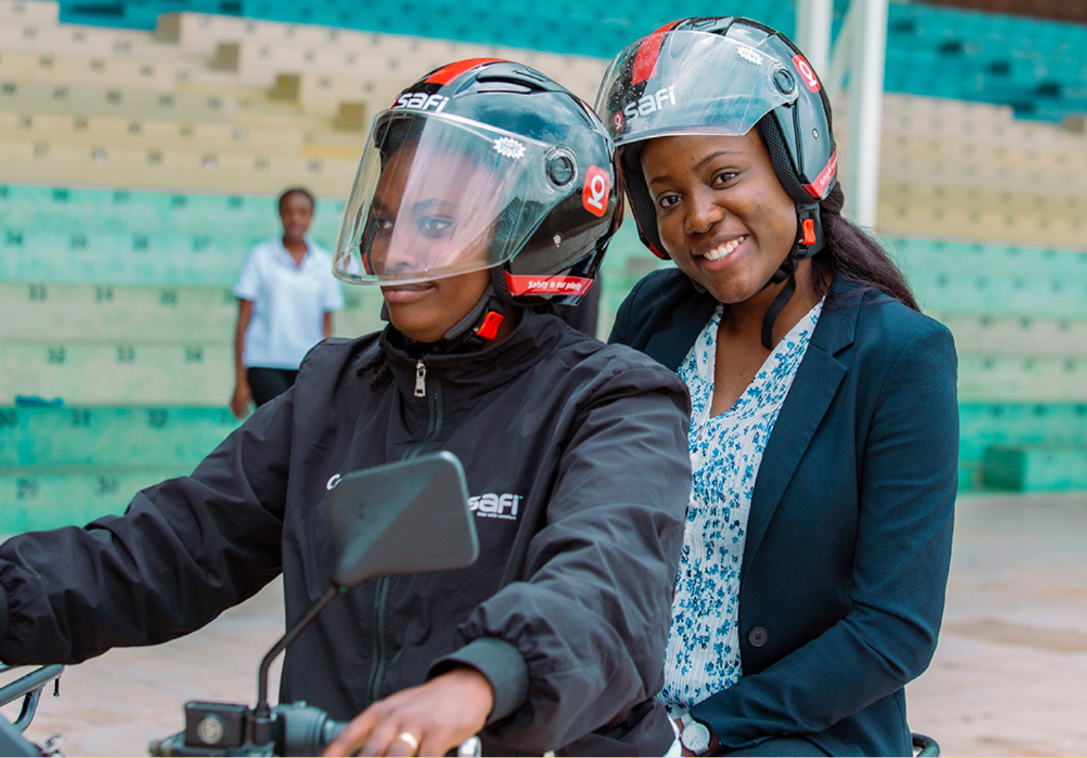
W.E.I.E - Women Empowerment in Entrepreneurship, SUL E-Mobility - SAFI Universal Link Ltd