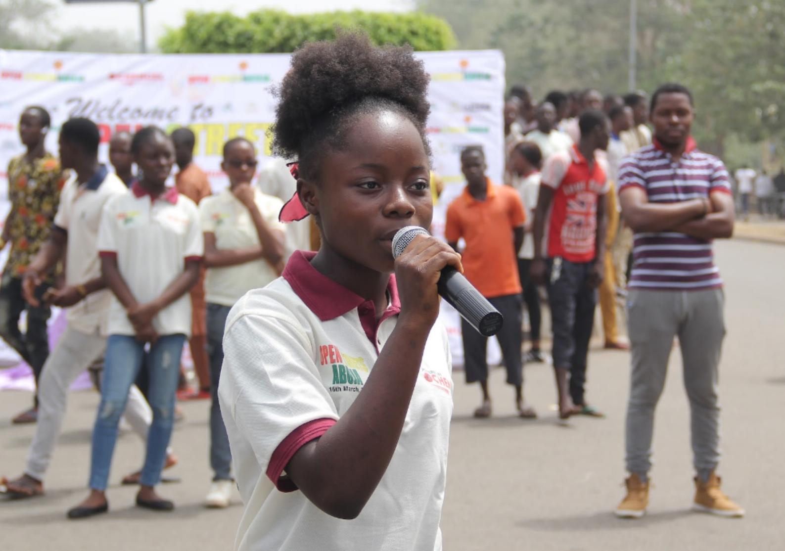
Open Streets Initiative, Abuja