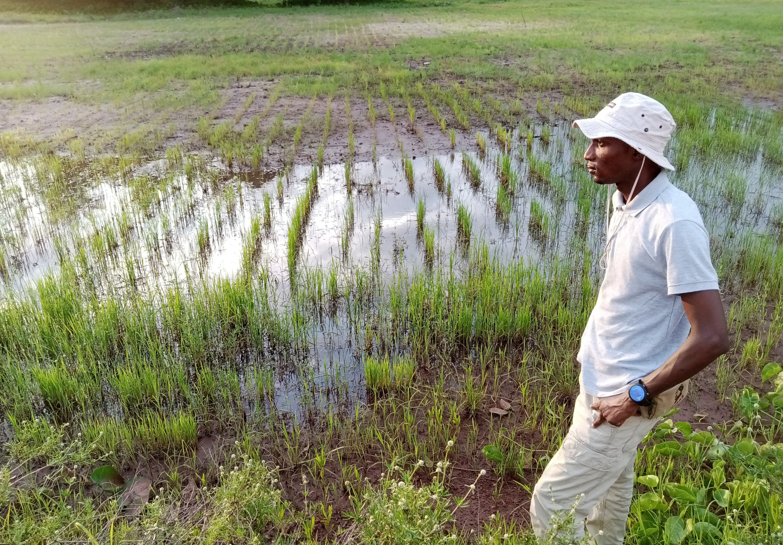
Contribution to the restoration of land affected by salinization in the locality of Djilor