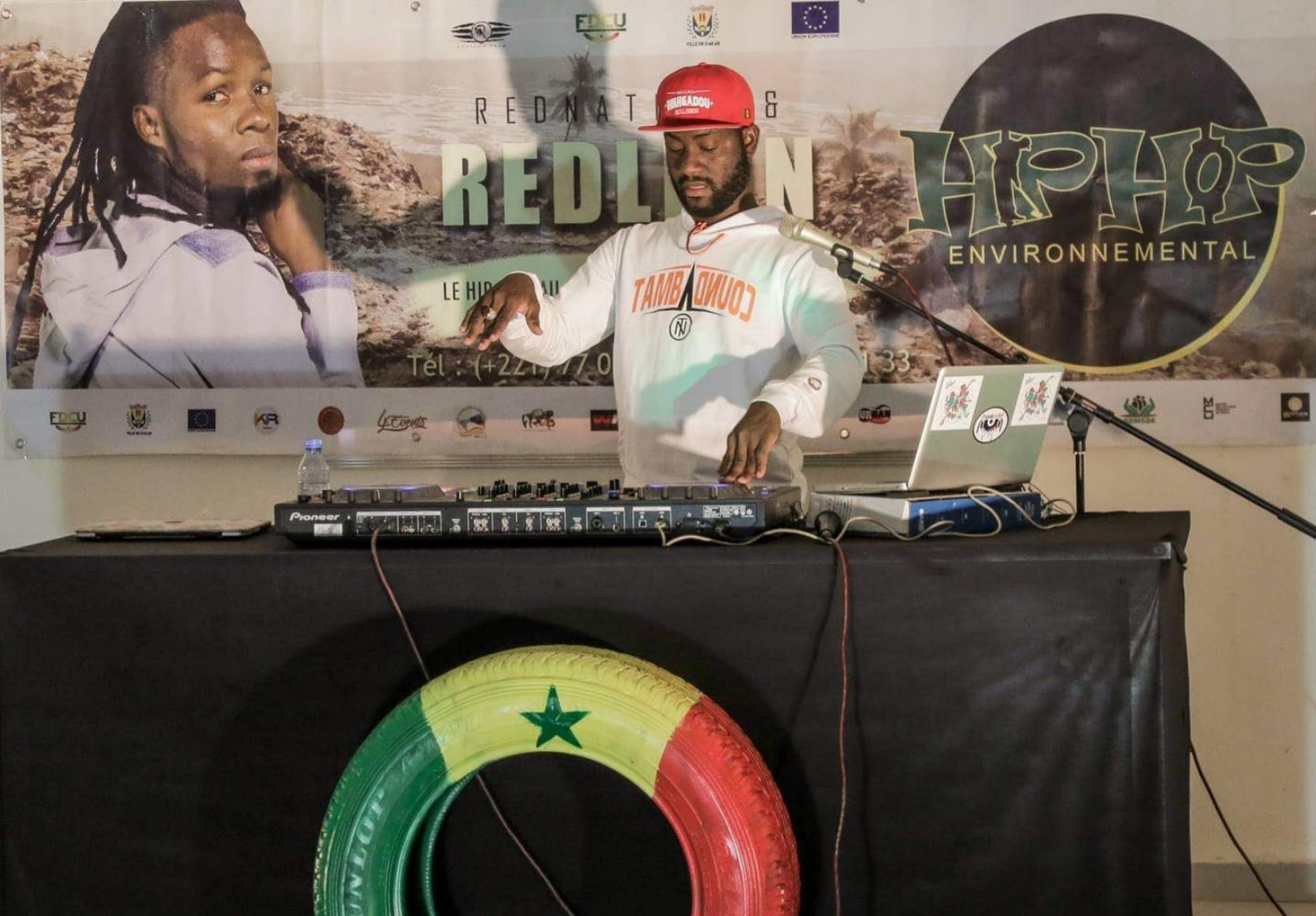
Festival international Hiphop environnement