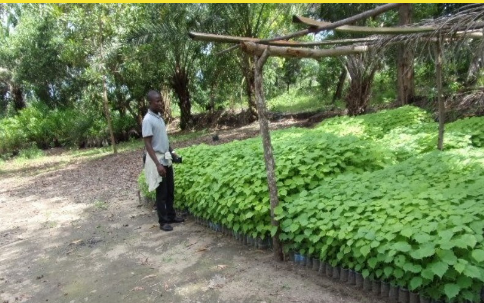
CAIM - Modern Integrated Farming Center