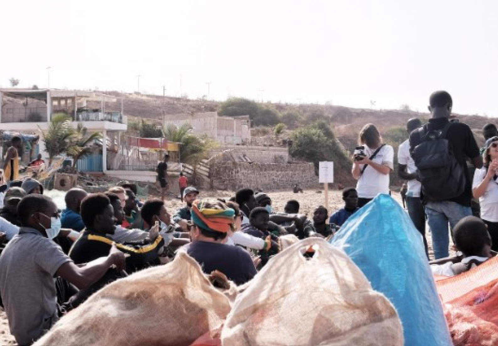
Sustainable beach, Dakar