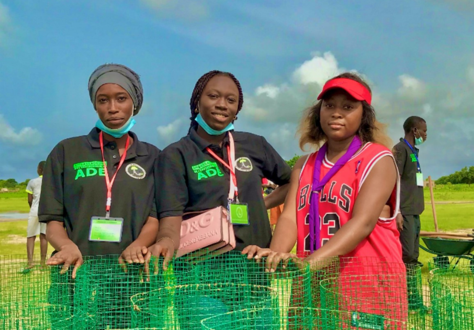
CRC - Communal reforestation campaign