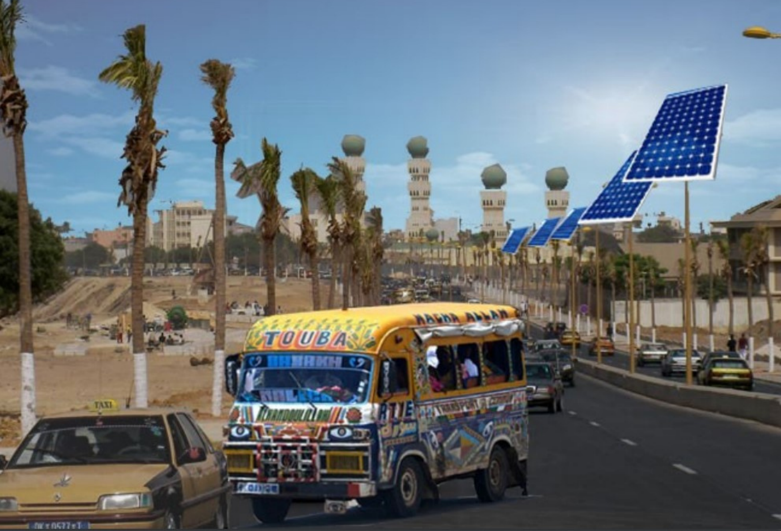
EcoCar Solar - sustainable mobility for the African city