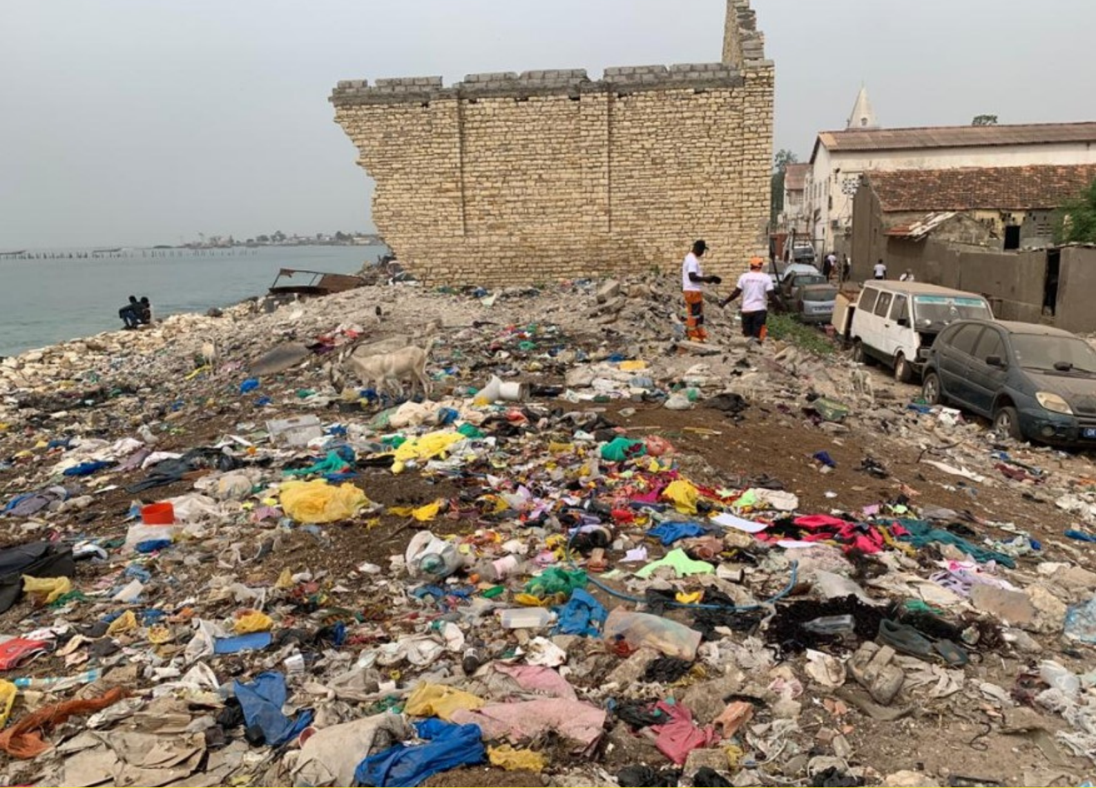
Project for the redevelopment of the Keury kao coastline (Rufisque)