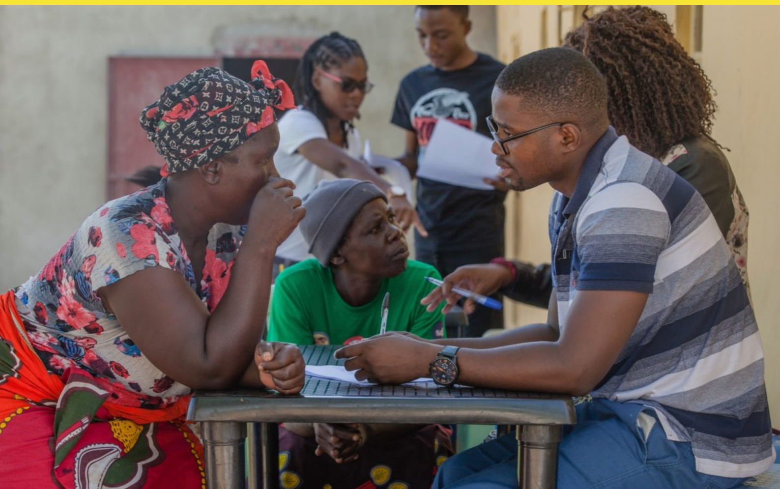
LoCAL - Local Climate Adaptive Living Facility