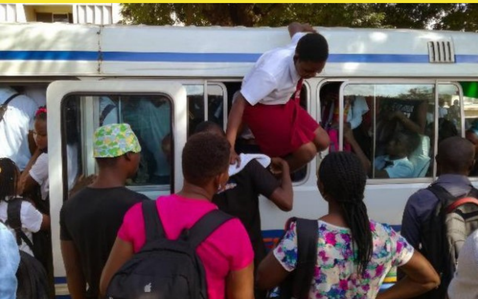
Mainstreaming Gender – Maputo's Mobility experience