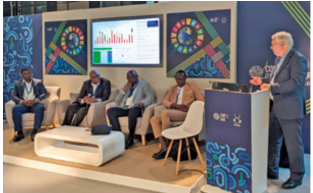
Side-event on ecological connectivity - COP28, December 2023.