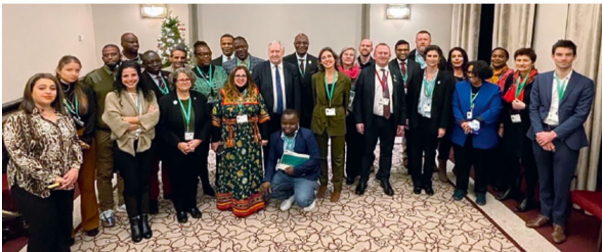
Official launch of the international coalition for biodiversity corridors in Africa - COP15, December 2022.

The modes of financing for conservation and development are undergoing several changes. In this context, the coalition also aims to monitor the situation and disseminate up-to-date information on: new financing, mobilisation of climate finance and evolution of standards, impact in terms of development for the benefit of local populations.