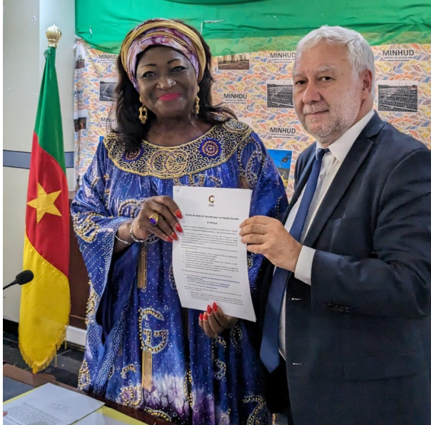
Presentation of the Yaounde Roadmap for Sustainable Habitats in Africa to the Minister of Habitat and Urban Development of Cameroon, Célestine Ketcha Courtès