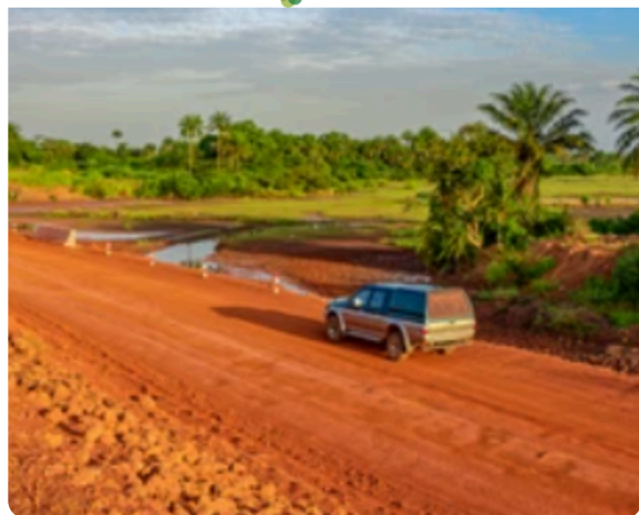
Biodiversity and socio-economic conditions

Between pressure on natural resources, economic vulnerability, and conservation challenges , Lebekéré illustrates the complex balances that must be built in territories of high ecological value. This socio-economic diagnosis , carried out as part of the Biodiversity Corridors in Guinea project, highlights the close links between living conditions, local economic dynamics, and biodiversity conservation .